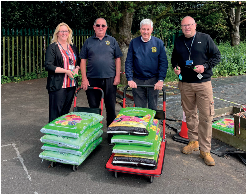
Rotary at Spilsby Primary School

It is a comparatively small club in Rotary terms with just over 20 members but it is big on support for the local community. Spilsby Rotary Club sponsors and helps to organize Bike Night, the fireworks display on Bonfire Night, Cracker Day, the Christmas Carol concert at St James's Church and the town's Easter Fair. It also, along with the Town Council, contributes to the cost of the Christmas tree that members erect near the statue of Sir John Franklin.