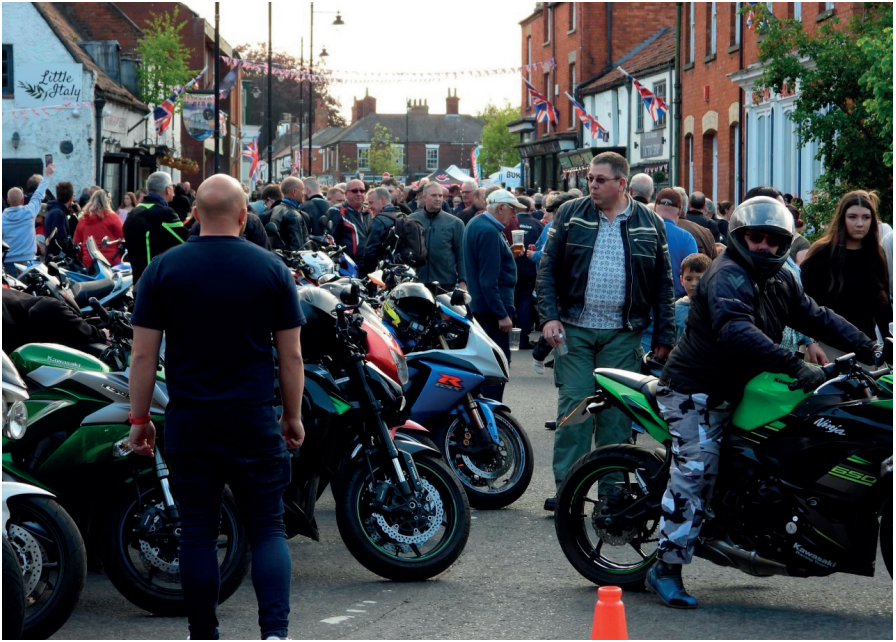
Spilsby Bike Night

Spilsby Rotary Club has provided financial support for a range of worthy causes such as the Lincolnshire Blood Bikes Service, Linkage Community Trust, Spilsby Junior Football Club, Lincs and Notts Air Ambulance and Skegness Coastwatch Station. All cash raised at local events goes directly to charities that the club supports without any deduction to cover the club's costs.